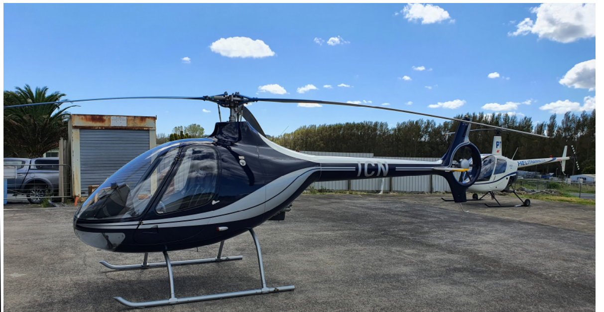
2013 Guimbal Cabri G2